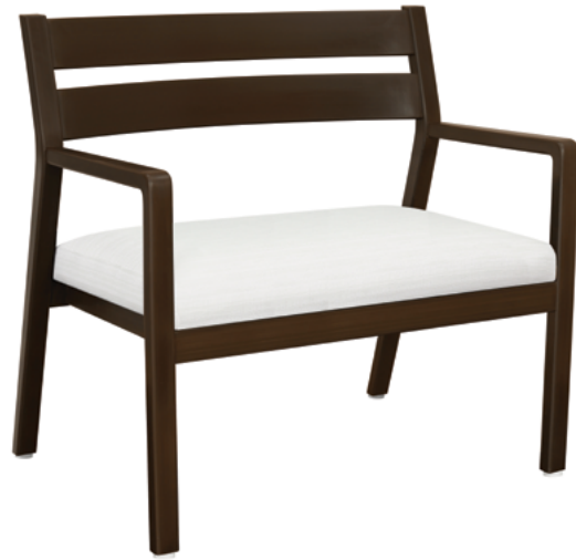
Model: CTEB11 34W 24.5D 33.75H 30.5SW 19SD 19SH 25AH

The Caterina Bariatric Guest Slat Back chair is a perfect marriage of aesthetics and durability. Built for maximum stability and strength with the addition of solid steel in all joints, this thoughtfully designed chair accommodates generous proportions. Available as a slat back and a short upholstered back, it features a spacious removable seat, an angled back and contemporary arms to facilitate ingress and egress.