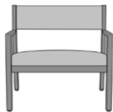
CTEB21 34W 24.5D 33.75H 25AH